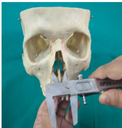
Fig. 3: Showing measurement of Lower Width of Piriform Aperture was measured between the right and left margin of the anterior surface of the maxilla