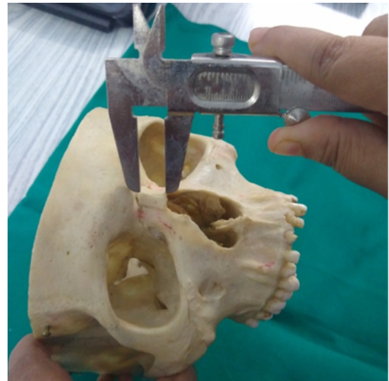
Fig. 4: Showing measurement of height of nasal bone were measured from the nasion to the rhino