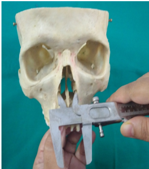
Fig. 2: Showing measurement of upper width of Piriform Aperture was measured between the right and left naso-maxillary junction