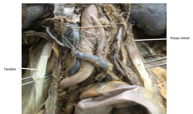
Fig. 1: Showing bilateral variations of psoas minor lies on anterior surface of psoas major

The average length of the muscle was 19.66 mm (range:16.7 mm – 22.5 mm), average width was 2.78 mm (range: 1.0 mm - 3.2 mm) and average circumference was 2.79 mm (range: 1.7 mm - maximum 5.6 mm), average tendon length -16mm-19mm. I have taken maximum width and circumference between origin and insertion.