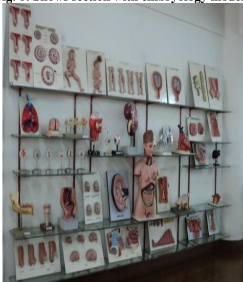
Fig. 6: Shows section with embryology models.