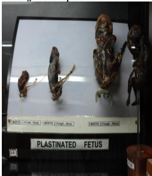
Fig. 5: shows plastination section.