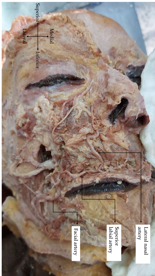
Fig. 1: Facial artery and its terminal branches on the right side. (A- Facial artery, B- Superior Labial artery, C- Lateral Nasal artery).