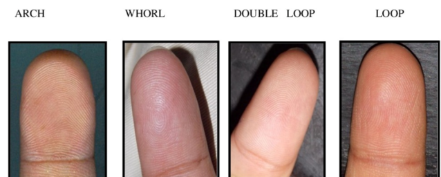
Fig. 2: Fingertip patterns

The arithmetic mean and standard deviation was calculated and the Student 't' test was applied for quantitative analysis. The Chi squared test was applied for qualitative analysis.